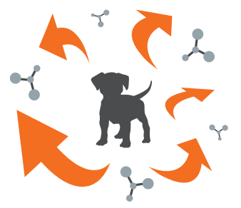
Unregulated movement of dogs spreads rabies

So, whilst only a minority of Indonesians consume dog meat - in fact it is estimated that just 7% of the population nationwide ever consumes dog meat – the trade threatens the health and safety of the whole country.