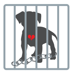
Immense Animal Suffering

For those who survive, they watch others being brutally killed in filthy slaughterhouses whilst they wait their turn. Their fear is unimaginable.